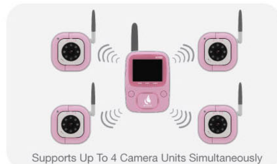
Supports Up To 4 Camera Units Simultaneously